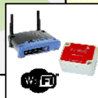
Wi-Fi Sensor Solution